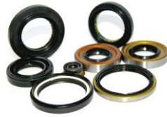
Radial Shaft Seals